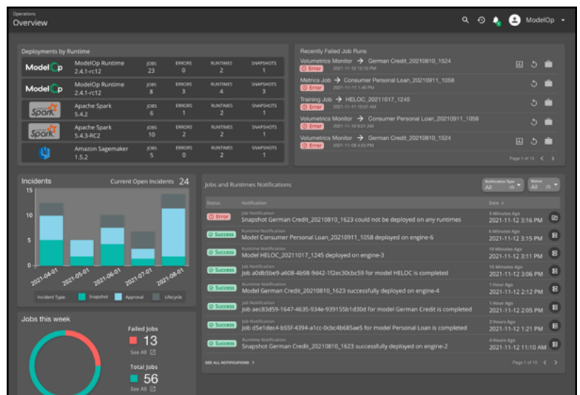
Comprehensive set of out-of-the-box tests

ModelOp, the pioneer of ModelOps software, enables enterprises to address the critical governance and scale challenges necessary to fully unlock the transformational value of enterprise AI and Machine Learning investments. Core to any AI orchestration platform, G2000 companies use ModelOp products to govern, monitor and orchestrate models across the enterprise and deliver reliable, compliant and scalable AI initiatives.